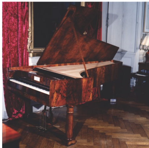
Graf, Vienna c1827