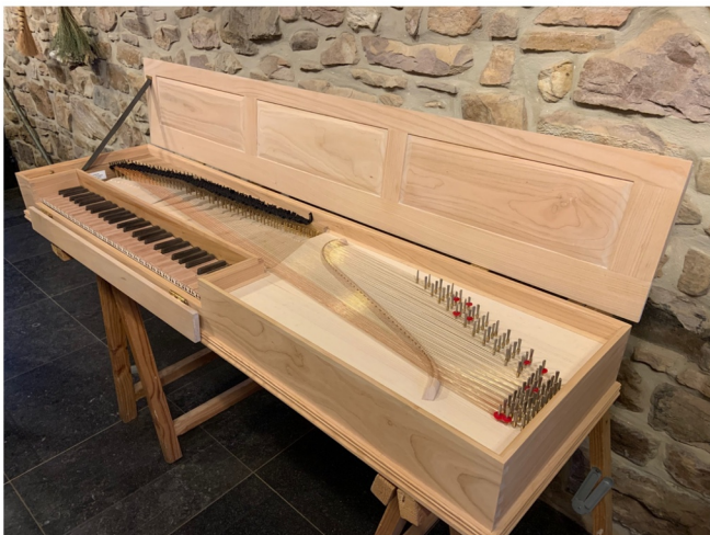
Clavichord by Pierre Verbeek after Gottlob Hubert, 1786

Using the collection of keyboards including 6 fretted and unfretted clavichords, Alain Roudier will teach what the touch of the clavichord brings to the touch of the pianoforte, based in particular on the treatises of theorists and composers from the 15th to the 18th century. Pierre Verbeek will delve deeper into more specific subjects concerning the making of the clavichord, its acoustics, its tuning, the impact of frets on interpretation and legato. The modern repertoire of the instrument and its current manufacture will also be covered.