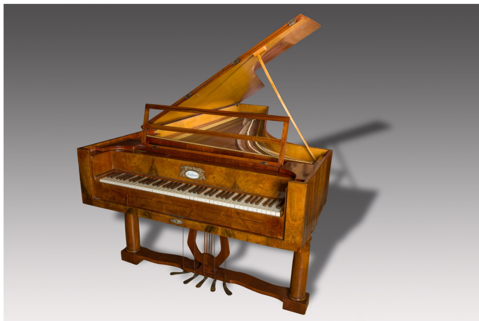
Schätzle, Vienna, c1828

The nearest airport is Marseille. Should you choose this option, you will travel to Villeneuve on your own.