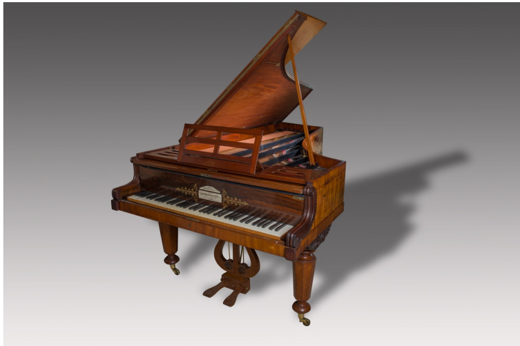
Broadwood Chopin, c1834

This in-depth search for sound and authenticity is made possible during this academy thanks to the historical instrument collection of Le Temps Retrouvé , and to both teachers who will guide students individually and collectively.