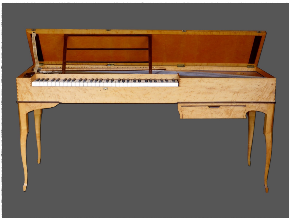
Clavichord by Haas (creation), c1970

Villeneuve-lez-Avignon is located 9 km from Avignon-TGV station. Travels from the train station to the academy will be organized. The nearest airport is Marseille. Should you choose this option, you will travel to Villeneuve on your own.